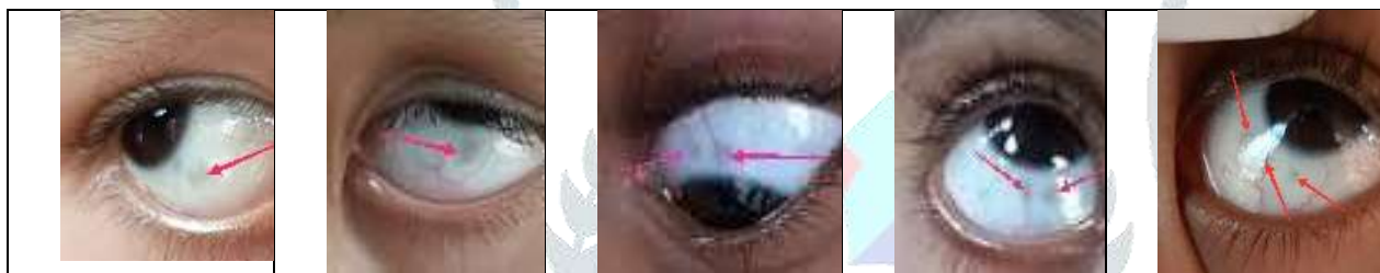
Plate-3: Observation of scleral melanocytosis in white portion of eyes.

Bitot's spots were observed in 4.5% of preschool children. It was noted that in the conjunctiva of eyes Bitot's spots were located to temporal portion of cornea (Plate-2). These Bitot's spots were typically triangular keratinized spots. The lesions of Bitot's spots were dry patches not wetted by tears. Few Bitot's spots were appeared foamy. Bitot's spots are localized areas of xerosis its appearance might be depends accumulation of bacteria on a site of bulbar portion of conjunctiva of eyes (William J. Darby et. al. 1960). Presence of Bitot's spots indicates vitamin A deficiency in population (D.W. Khandait et.al.1999; NMB 2003).