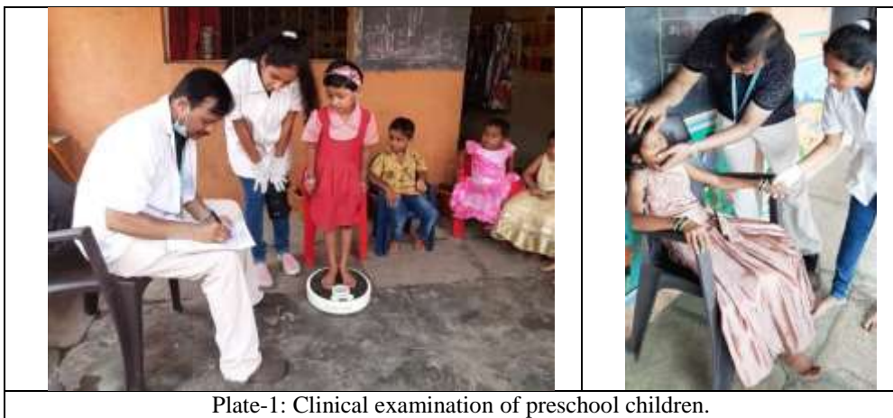
Plate-1: Clinical examination of preschool children.